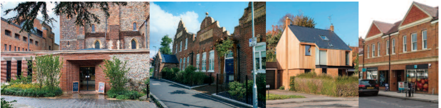
2021 Award winners. From left to right: Cathedral Welcome Centre, Beaumont Gardens, Barncroft Way, The Co-op London Road.

Head Office. It has now been restored to its former glory and we appreciate the initiative shown by the owners in carrying out this work.