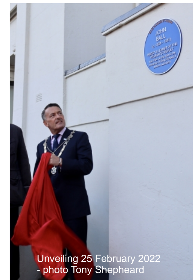
Unveiling 25 February 2022