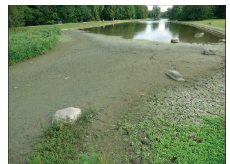
Verulamium Lake! Green Flag?