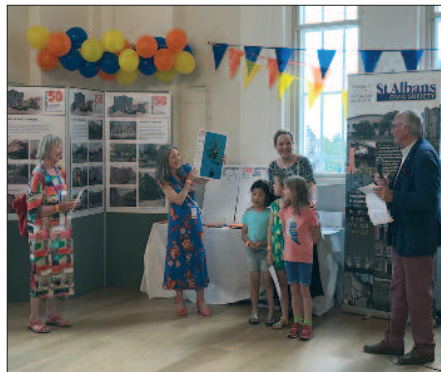
Primary Schools Art & Design Competition winners being presented with their prize of a tree to be planted in the school grounds.

conservation and highlighted some of the issues associated with conservation areas.